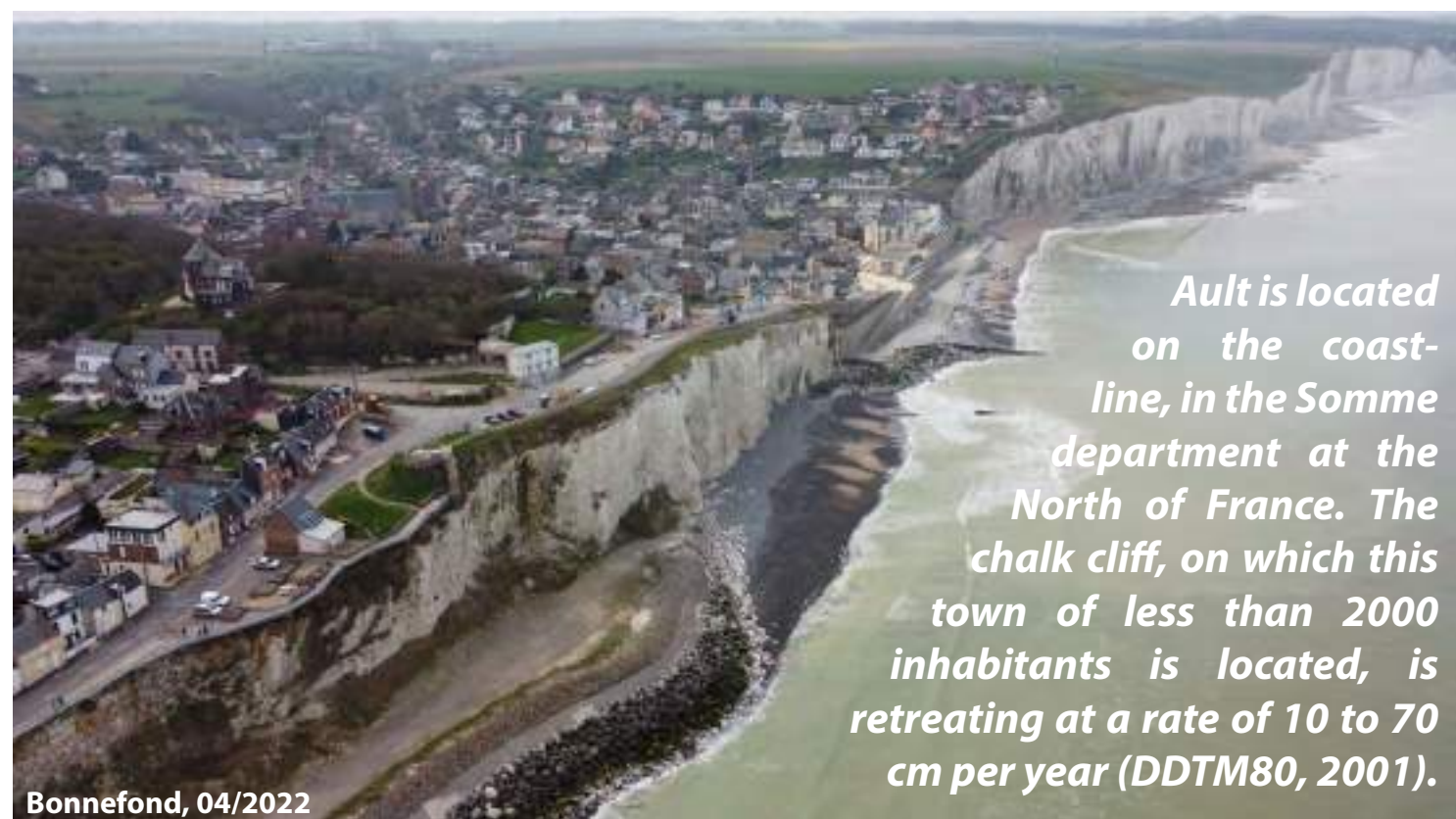
Ault is located on the coast-line, in the Somme department at the North of France. The chalk cliff, on which this town of less than 2000 inhabitants is located, is retreating at a rate of 10 to 70 cm per year (DDTM80, 2001).