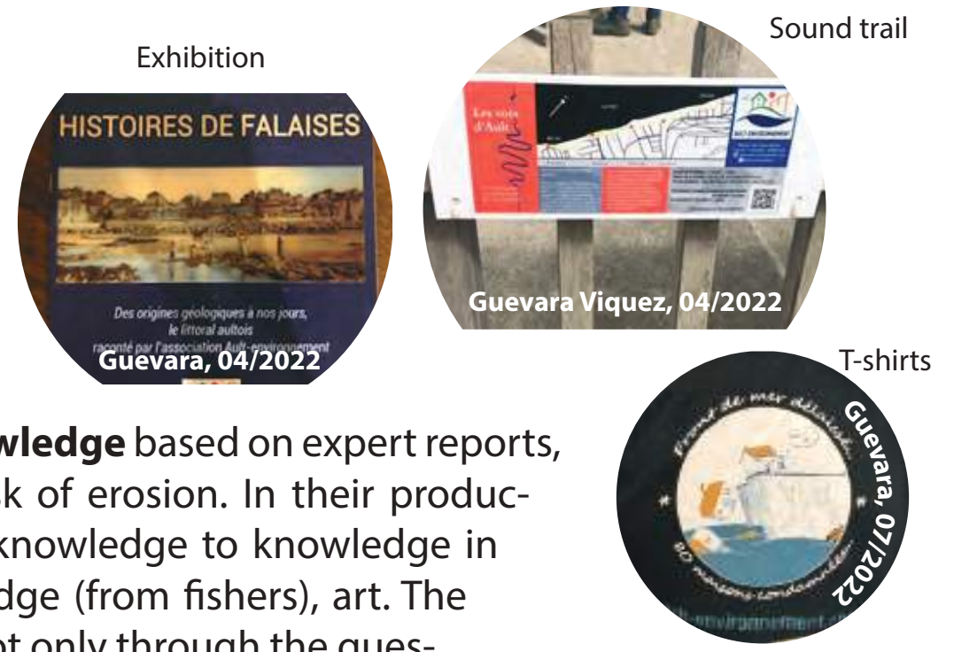
Exhibition HISTOIRES DE FALAISES Des origines géologiques à nos jours, le littoral aultin réalisé par l'association Ault-environnement