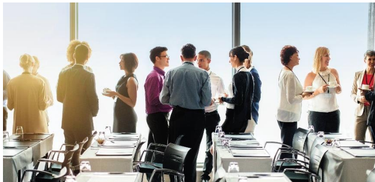
Our regional professionals in our Life & Health offices know your culture, law and business framework.

Like you, we welcome these challenges and like you, we work hard to develop these markets sustainably and profitably so we can help you meet the increasing demand for traditional plans that your customers need the world over.