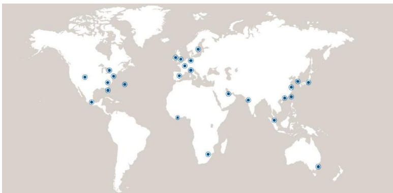
Life & Health reinsurance: offices worldwide

Our style is consultative: We are client focused, swift and undogmatic. Our business relationships are partnerships rather than sales-driven exchanges. Our aim is to team up with you for the long term, so we can get to know your organisation intimately and hence identify, suggest and customise needs-driven business solutions.