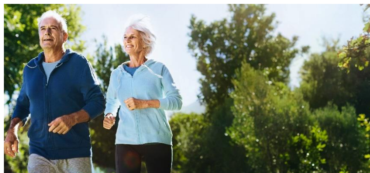
Increased prosperity, healthier lifestyles, better education, together with improved diagnostics and medical treatment, have all led to longer and better lives, which is excellent news for us all.

This is an area where we are a world leader and have an unmatched knowledge base. Our decades of experience in this market, with its roots as the first reinsurer in the UK underwritten annuities market, help us to support you with tailored products.