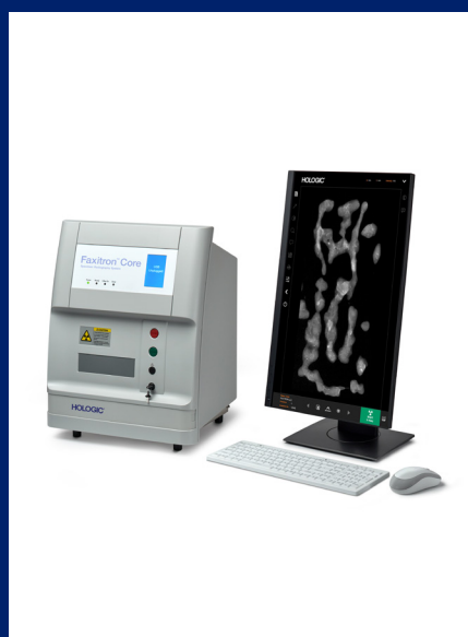
Faxitron® Core Specimen Radiography System