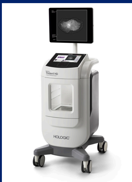
Faxitron® Trident® HD Specimen Radiography System