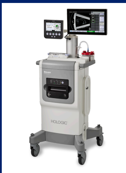
Brevera® Breast Biopsy System