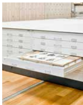
Drawers for prints