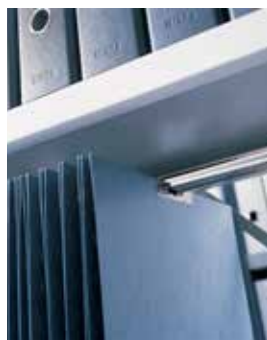
ZT pendel frame