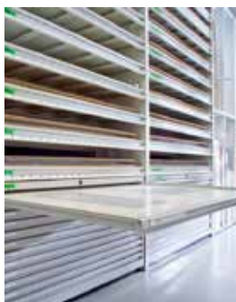
Oversized flat drawers