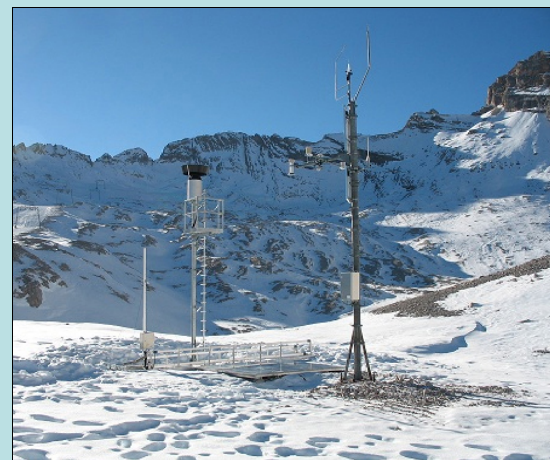
Fig. 2: Meteorological station at Zugspitzplatt (2420 m a.s.l.), equipped with an ultrasound snow height sensor, snow pack analyser and a snow scale.

The latter measures the volumetric contents of ice and water in different snow heights using complex impedance along flat ribbon sensors with at least two frequencies (Fig. 3). SWE and LWC will be used to validate the satellite data.