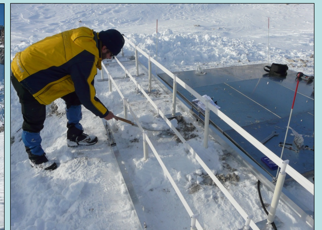
Fig. 3: In-situ measurement of snow water equivalents (snow scale) and liquid water contents of the snowpack in 10 cm, 30 cm and 50 cm height (snow pack analyser).