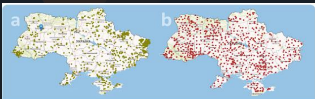
Fig. 2. Data of ukrainian ALDN monitoring platform: a) soils profiles; b) monitoring sites

Vasyl Cherlinka, Lidia Lelechenko, Yuriy Dmytruk