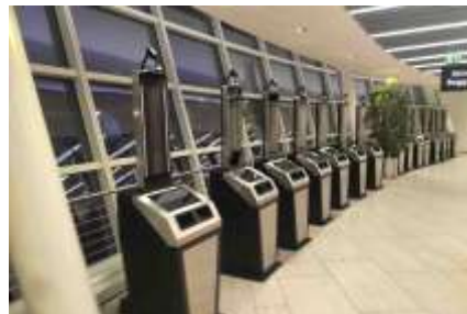
Rome Fiumicino (FCO)