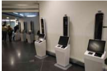
Milan Linate (LIN)