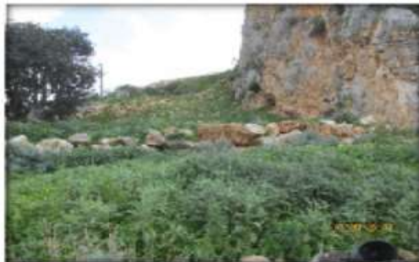
Improvement of soil condition in Italy (Sicily)