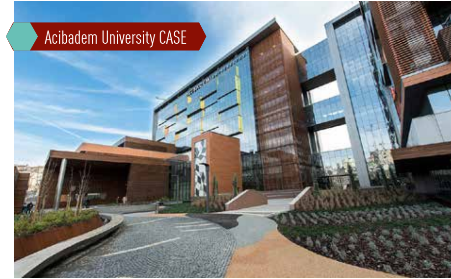
Acibadem University CASE