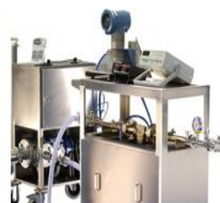
On-site Flowmeter Calibrations

Our skilled Service Division provides service, repair and calibration services for a comprehensive range of instrumentation and valve equipment, both in our Manchester workshops and on-site.