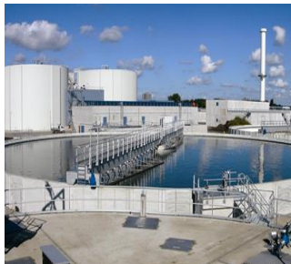
Water & Waste Water

BKW work along with our customers to understand their application requirements and help implement effective solutions. Our expertise enables us to provide a broad range of industry-specific products and services.