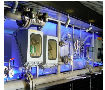
Plant Equipment & OEM