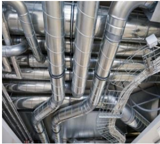
Heating, Ventilation & Air Conditioning