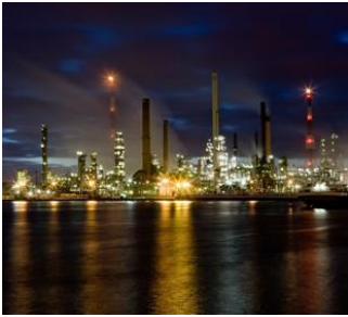
Chemical & Petrochemical