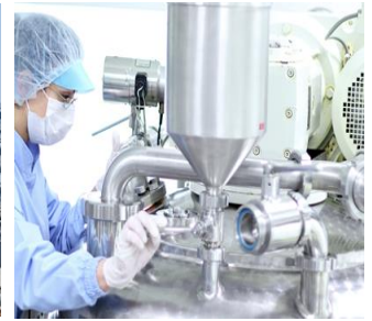
Pharmaceutical & Biotech