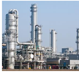
Process Plant EPC Contractors