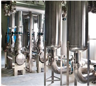
Food & Beverage