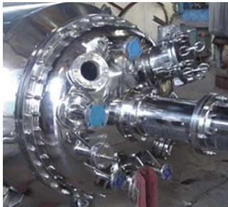
Tank, Boiler & Reactor