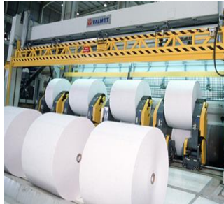
Paper & Pulp