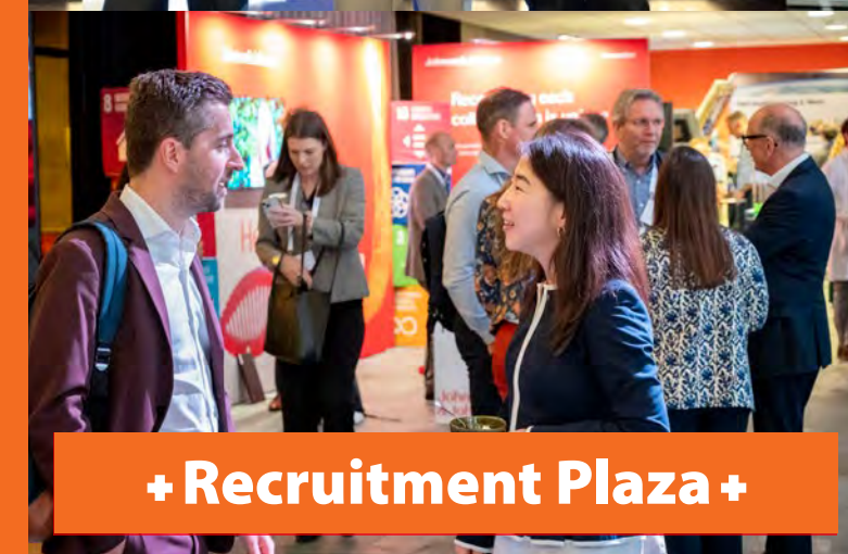
+ Recruitment Plaza +