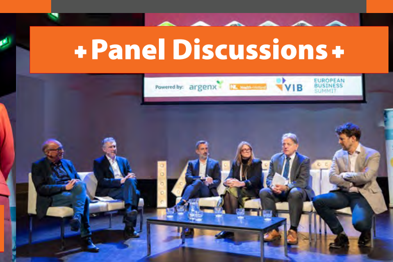
+ Panel Discussions +