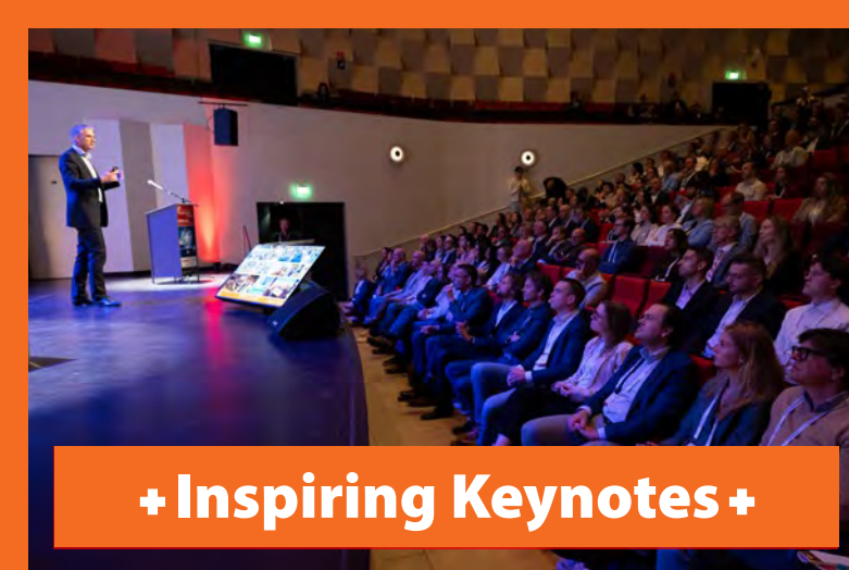
+ Inspiring Keynotes +