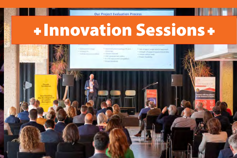
+ Innovation Sessions +