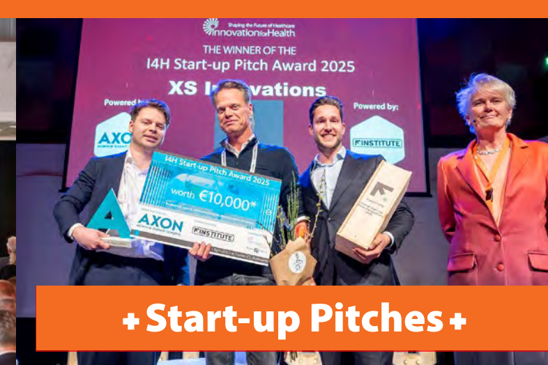
+ Start-up Pitches +