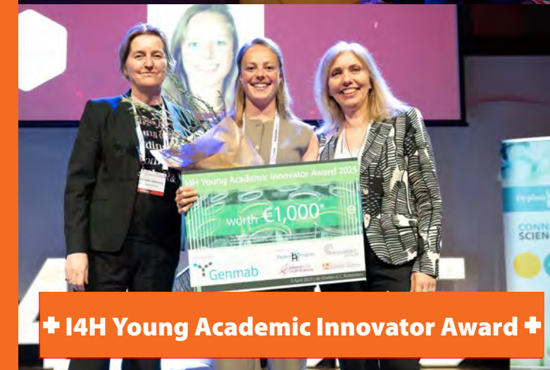
+ I4H Young Academic Innovator Award +