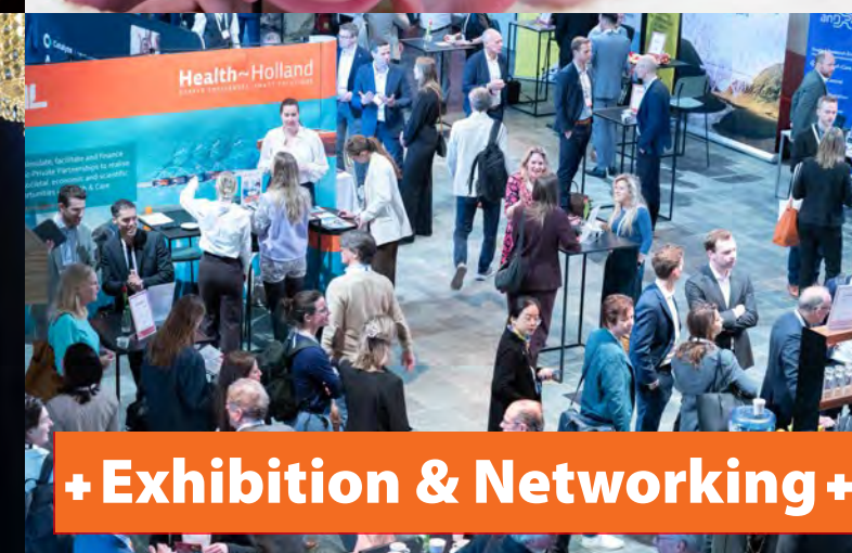
+ Exhibition & Networking +