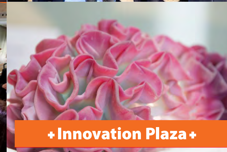
+ Innovation Plaza +