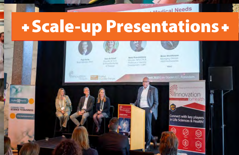
+ Scale-up Presentations +