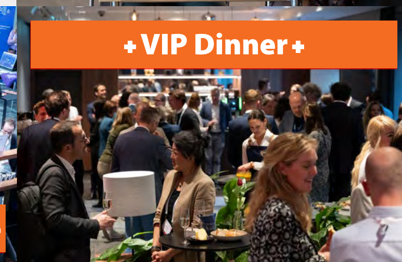
+ VIP Dinner +