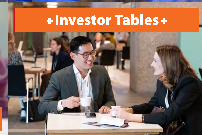
+ Investor Tables +