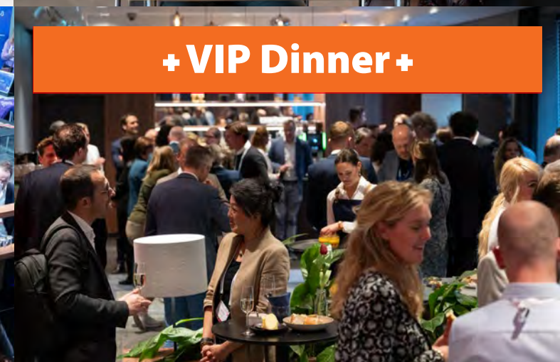
+ VIP Dinner +