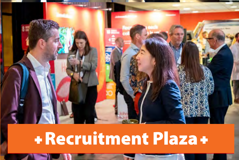
+ Recruitment Plaza +