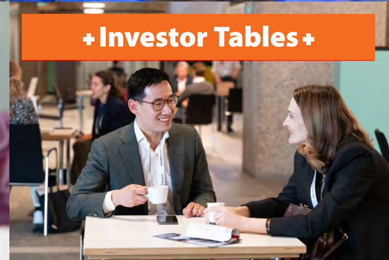
+ Investor Tables +