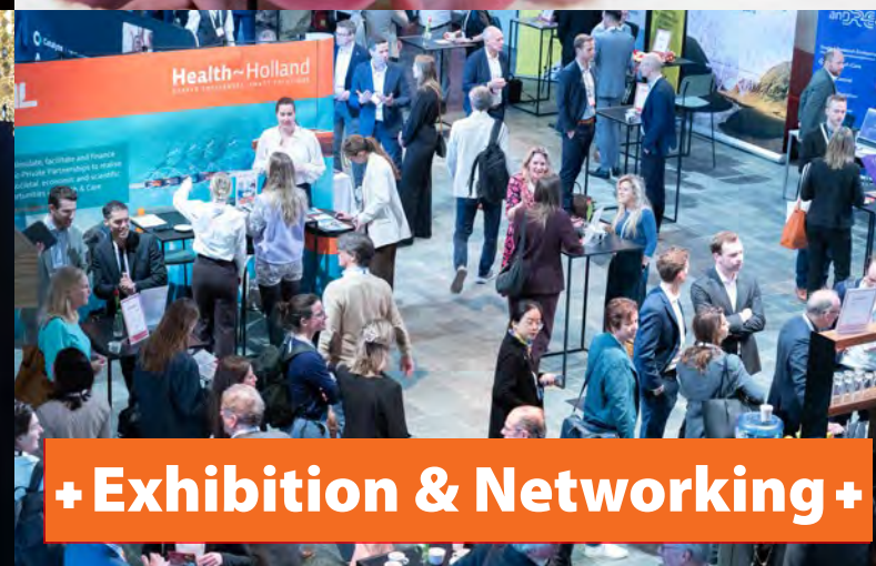
+ Exhibition & Networking +