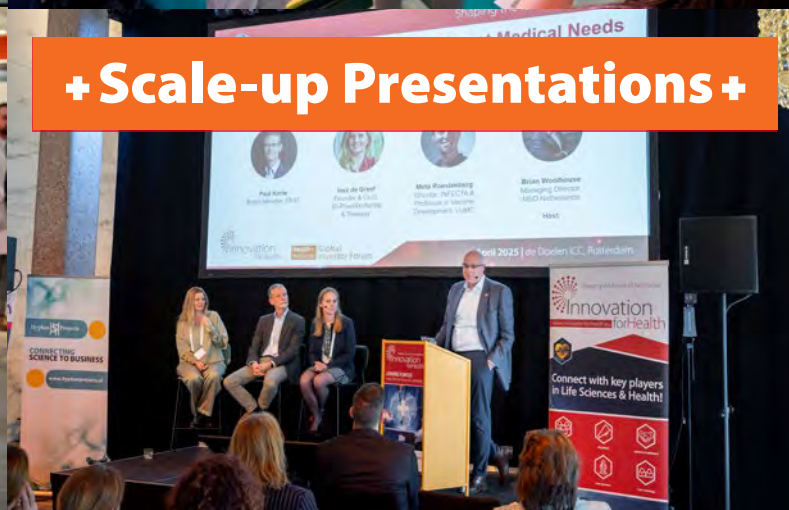
+ Scale-up Presentations +