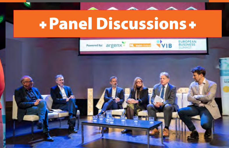
+ Panel Discussions +