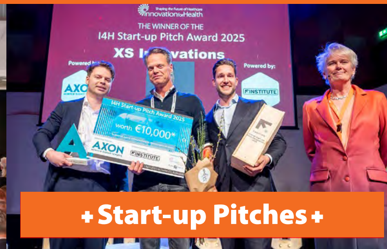
+ Start-up Pitches +