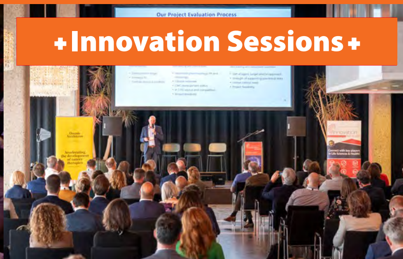
+ Innovation Sessions +