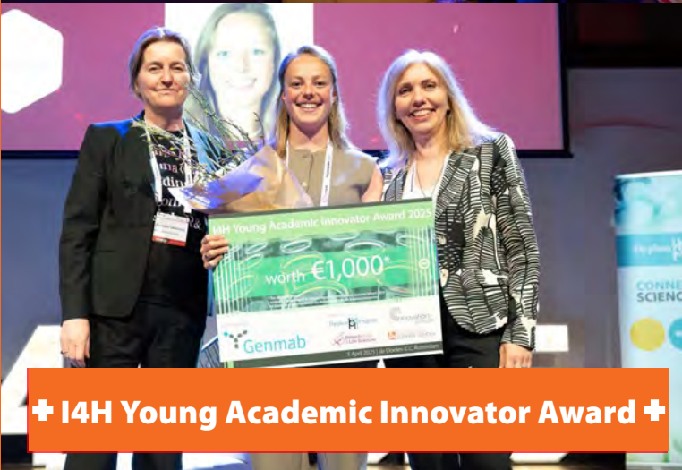
+ I4H Young Academic Innovator Award +