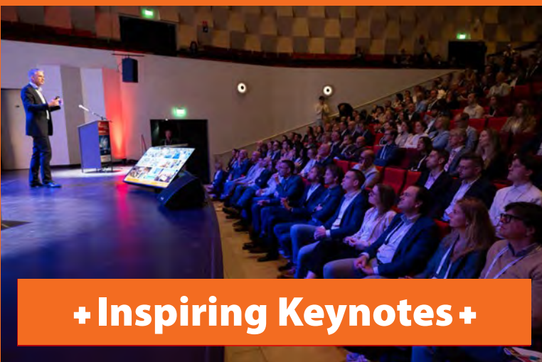
+ Inspiring Keynotes +