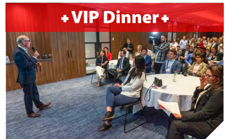
+ VIP Dinner +