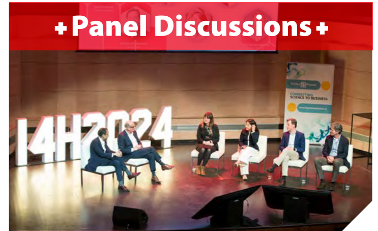
+ Panel Discussions +