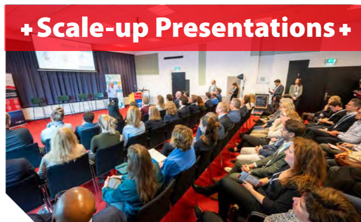
+ Scale-up Presentations +