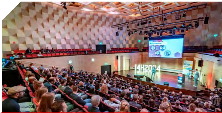
+ Inspiring Keynotes +