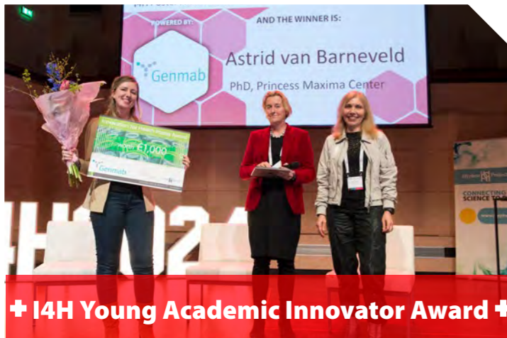
+ I4H Young Academic Innovator Award +