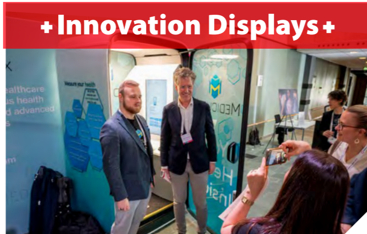
+ Innovation Displays +