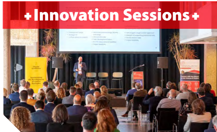
+ Innovation Sessions +