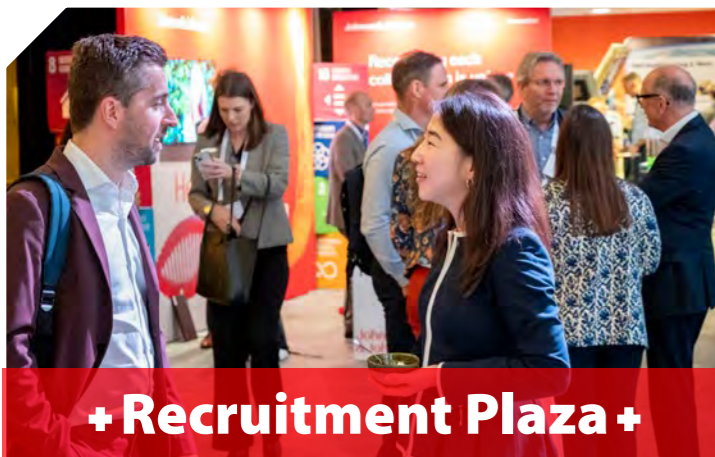
+ Recruitment Plaza +