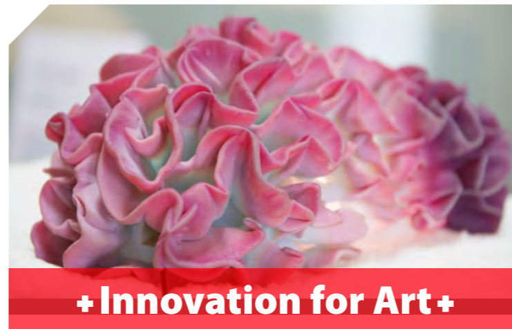
+ Innovation for Art +