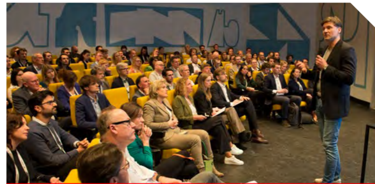
+ Start-up Pitches +