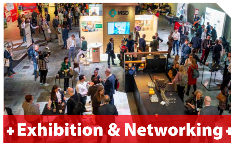
+ Exhibition & Networking +