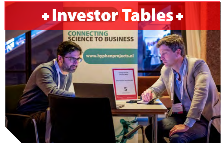
+ Investor Tables +