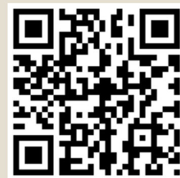
Access the AI-powered Interview Coaching Web-based App