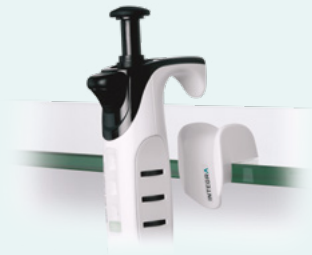
Shelf hook (3210 and 3211)