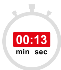
Traditional manual pipettes