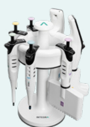
Pipette rotary stand (3213)