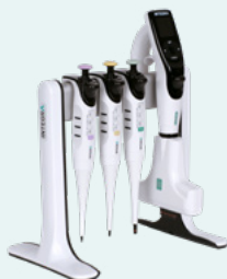
Short linear stand (3214)