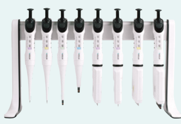
Linear stand (3215)