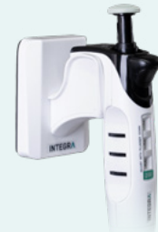
Wall mount (3205)