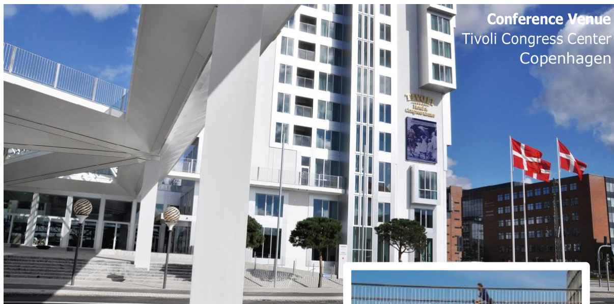
Conference Venue Tivoli Congress Center Copenhagen

DIS ® DIS CONGRESS SERVICE COPENHAGEN A/S