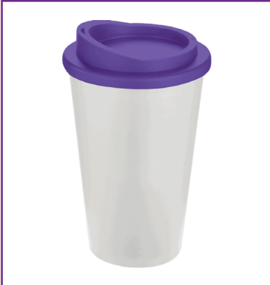
Americano Cup £1,000+VAT 1 colour printed logo