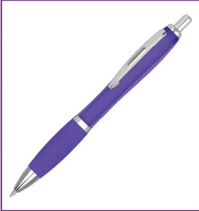
Frosted Magenta Pen £500+VAT 1 colour printed logo