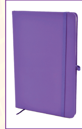
A5 Soft Feel Notebook £1,360+VAT 1 colour printed logo