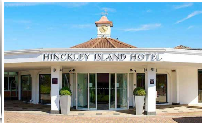
Leonardo Hotel Hinckley Island Watling Street, Burbage, Hinckley LE10 3JA