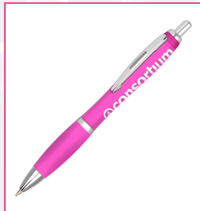
Frosted Magenta Pen £500+vat 1 colour printed logo