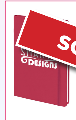
A5 Folder £1,500+vat 1 colour printed logo