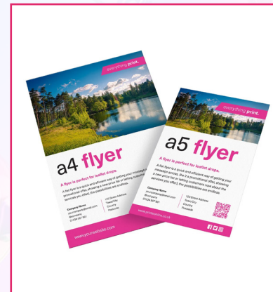
Delegate Bag Inserts £500+vat Supplied by sponsor