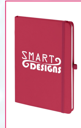
A5 Soft Feel Notebook £1,250+VAT 1 colour printed logo