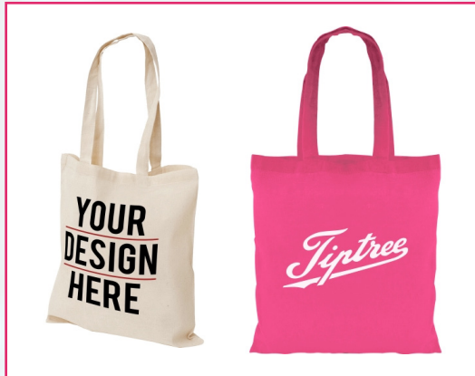
Delegate Bags £750+VAT 1 colour printed logo