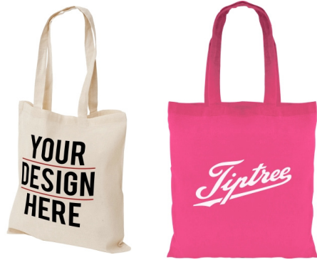
Delegate Bags £1,900+vat 1 colour printed logo