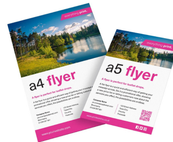
Delegate Bag Inserts £500+vat Supplied by sponsor