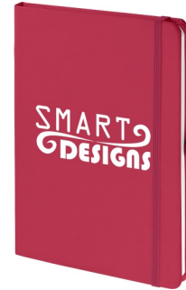
A5 Soft Feel Notebook £1,360+vat 1 colour printed logo