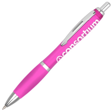
Frosted Magenta Pen £500+vat 1 colour printed logo