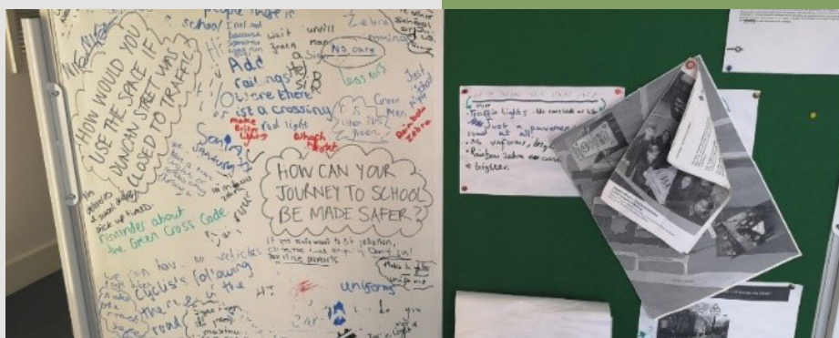
SYSTRA Consultation material

"When not closed the pavement is congested and it is easy to lose younger siblings in a sea of legs and they can then run into the road. The closure makes this much safer."