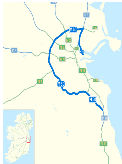
The M50 highway in Dublin, Ireland.

System and operations are designed for flexibility and scalability, enabling the future addition of new tolling points and multimodal digital mobility services with minimal overhead.