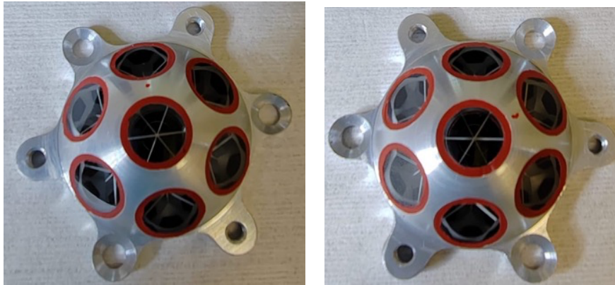
The two MLRH picoreflectors for Hera.

This research work is carried out and supported under the Agreement between ASI and University of Bologna n. 2022-8-HH.0 "Scientific Activities for the Hera Mission", WP 3100 of INFN-LNF.