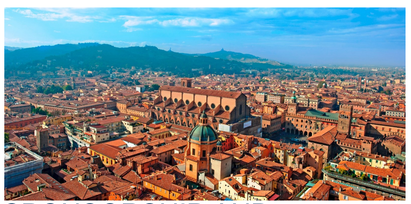
SPONSORSHIP AND EXHIBITION OPPORTUNITIES

BOLOGNA CONGRESSI, ITALY 13 – 16 MAY 2025