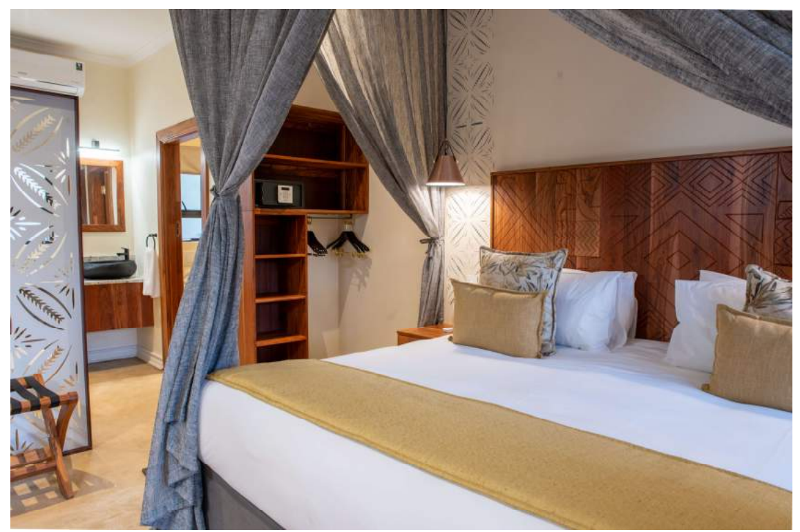
Honey moon suite above with outdoor shower below