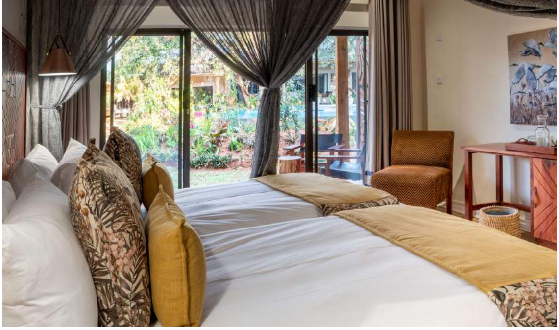
Double/Twin Deluxe Room