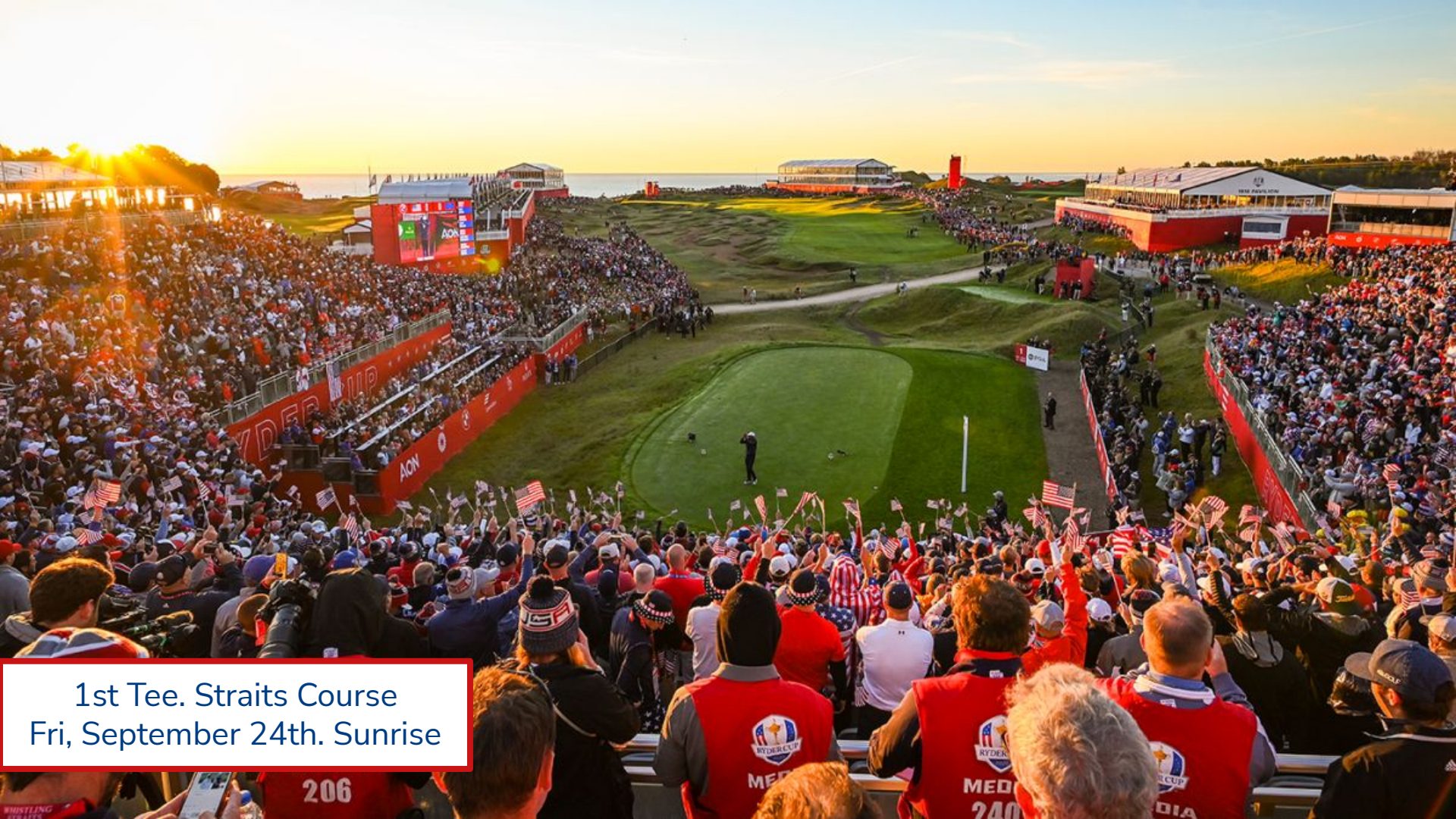
1st Tee. Straits Course Fri, September 24th. Sunrise