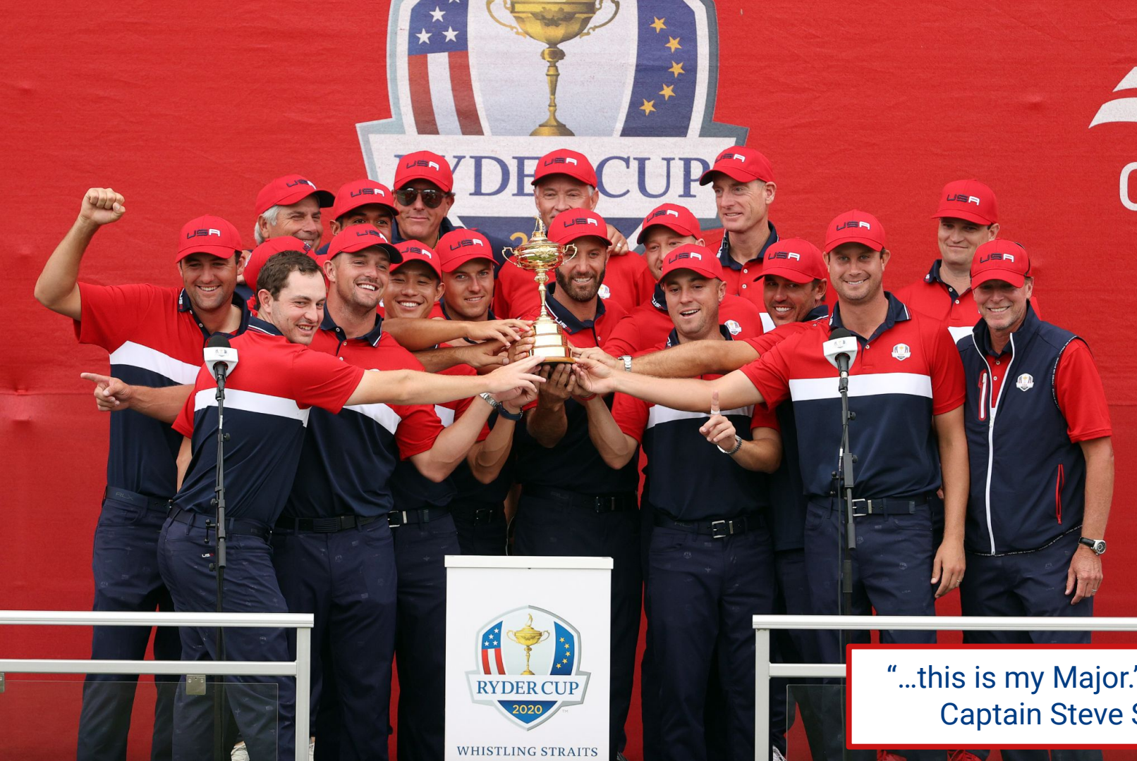
“...this is my Major.” - US Team Captain Steve Stricker