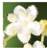
Image at 100% Size and at 300 dpi. Clear and crisp viewing and printing.

When submitting these files please ensure that original artwork is set to 300 dpi or greater when creating for best results at 100% size.