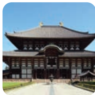
2022 Nara, Japan