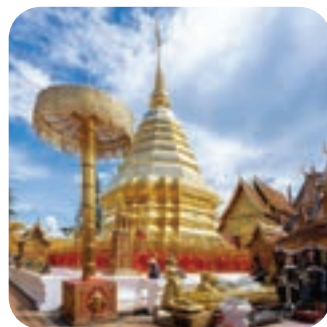
2016 Chiang Mai, Thailand