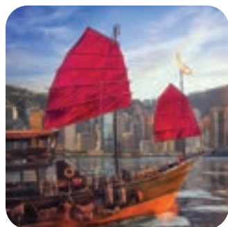
2024 Hong Kong, China