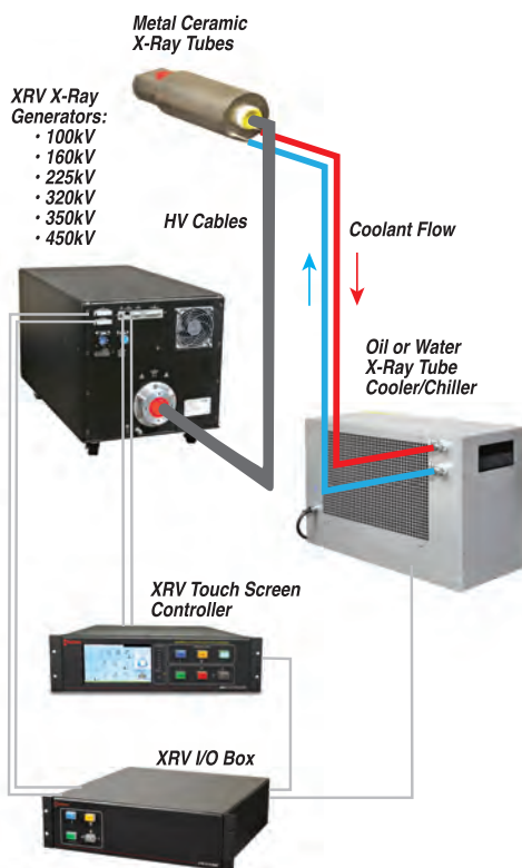
Typical Turn-Key X-Ray Source Solution from Spellman High Voltage.

When it comes to dependable HV power for X-Ray applications, Spellman High Voltage leads the way. No other manufacturer builds a more reliable, efficient, stable, or compact X-Ray Generator. Offering negative, positive or bipolar output ranging from 160kV to 450kV, Spellman can deliver an ideal solution for a wide variety of applications.