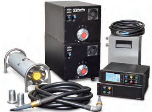
Shown above, with an output voltage of 450kV is our complete XRV450 turn-key sub system.