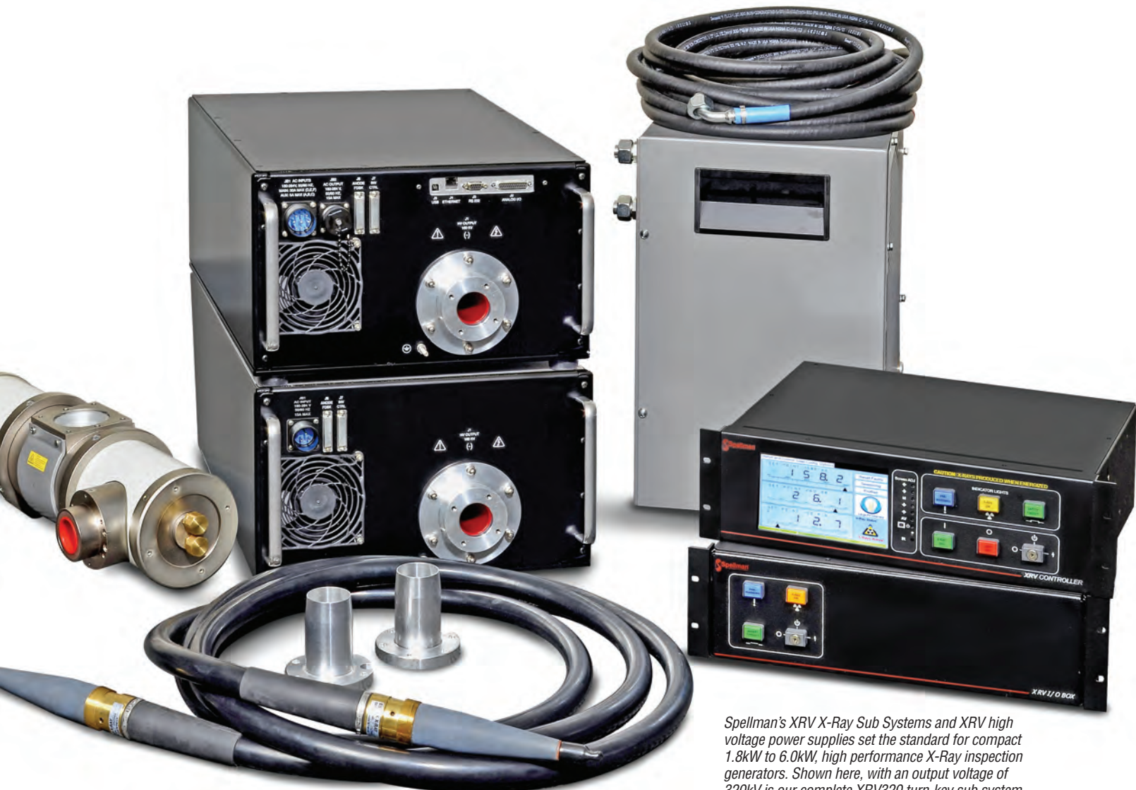
Spellman's XRV X-Ray Sub Systems and XRV high voltage power supplies set the standard for compact 1.8kW to 6.0kW, high performance X-Ray inspection generators. Shown here, with an output voltage of 320kV is our complete XRV320 turn-key sub system.