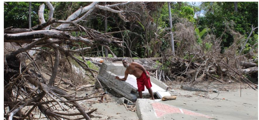
Tiwandé, Côte Est, Grande Terre, V. Duvat