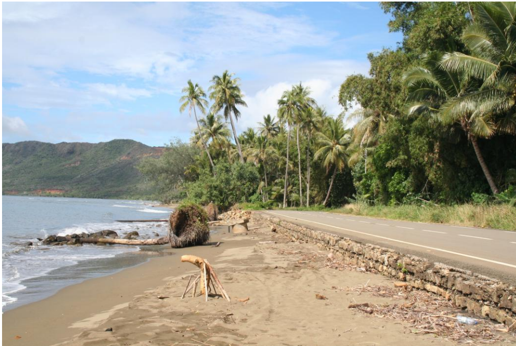
Ponérihouen, 2025