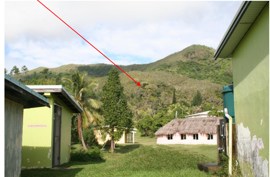
Ponérihouen, 2025