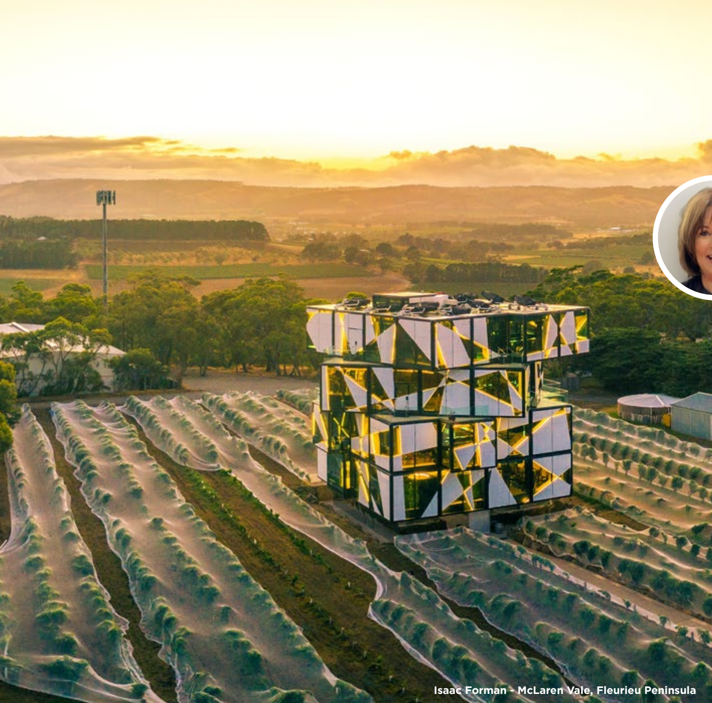
Isaac Forman - McLaren Vale, Fleurieu Peninsula