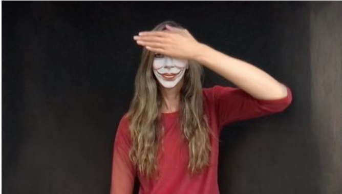
Figure 2 - An image of myself as I feature the iconic appearance of the 'anonymous' mask.

generative AI. As the figures within the piece undergo a series of identity transformations, the visual shifts not only serve as a poetic commentary on the dynamic evolution of identity but also illuminate the complex interplay of roles within a family unit. Here, identity is not fixed nor static; it is an ongoing performance, illustrating that a role such as a 'mother' can sometimes be perceived as a 'ghost', a 'child', a 'doctor' (Fig. 2), while a 'son' can be perceived as an 'old man', a 'rebel', an 'angel' or a 'robot' (Fig. 3).