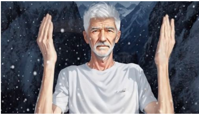
Figure 3 - An image of my son as he is featured as a mature adult.

Under the thematic essence of this artwork, the game 'peekaboo' is a deliberate choice. Traditionally associated with infants, Peekaboo transcends its simplistic structure to embody a nuanced interplay of roles. One participant assumes the task of concealing and revealing their face, while the other, typically the infant, eagerly anticipates the revelation. Beyond its capacity to delight, peekaboo is believed to manifest cognitive and emotional development in early life. Through its playful dynamics, infants gradually grasp the concept of object permanence, understanding that people and objects continue to exist even when they go out of sight. Moreover, the game facilitates the comprehension of temporal concepts such as 'before' and 'after'. In its oscillation between concealment and revelation, peekaboo evokes both anxiety and pleasure, as familiar faces momentarily vanish and reappear. Furthermore, the game cultivates essential skills of identification while nurturing a sense of individuality and separateness, encouraging the exploration and testing of reality through dynamic and playful relationships [2]. Within the artistic narrative of this project, peekaboo becomes a powerful metaphor for the understanding of connection and growth within familial and interpersonal relationships.