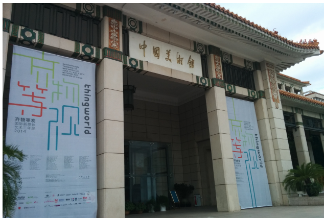
Figure 1 Facade of the National Art Museum of China. Molior was a partner at the International Triennale of New Media arts.

Molior is an organization based in Montreal specialized in the production of large-scale international exhibitions and art projects at the intersection of arts, sciences and technologies.