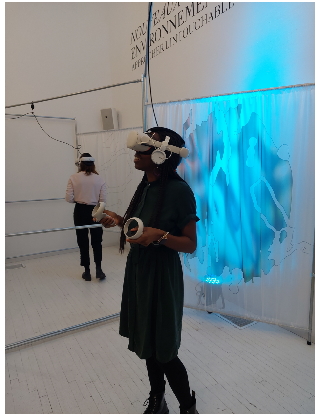
Figure 2 Exhibition in Montreal "New Surroundings: Approaching the Untouchable"