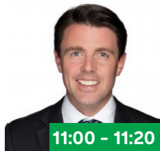
ASSISTANT MINISTER FOR FORESTRY SENATOR HON JONNO DUNIAM