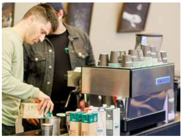
ALC Supply Chain Logistics Summit 2024