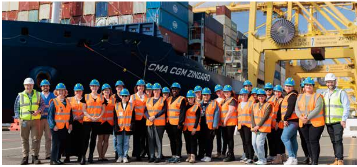
DP world, ALC Staff with Wayfinder Attendees (Sydney)