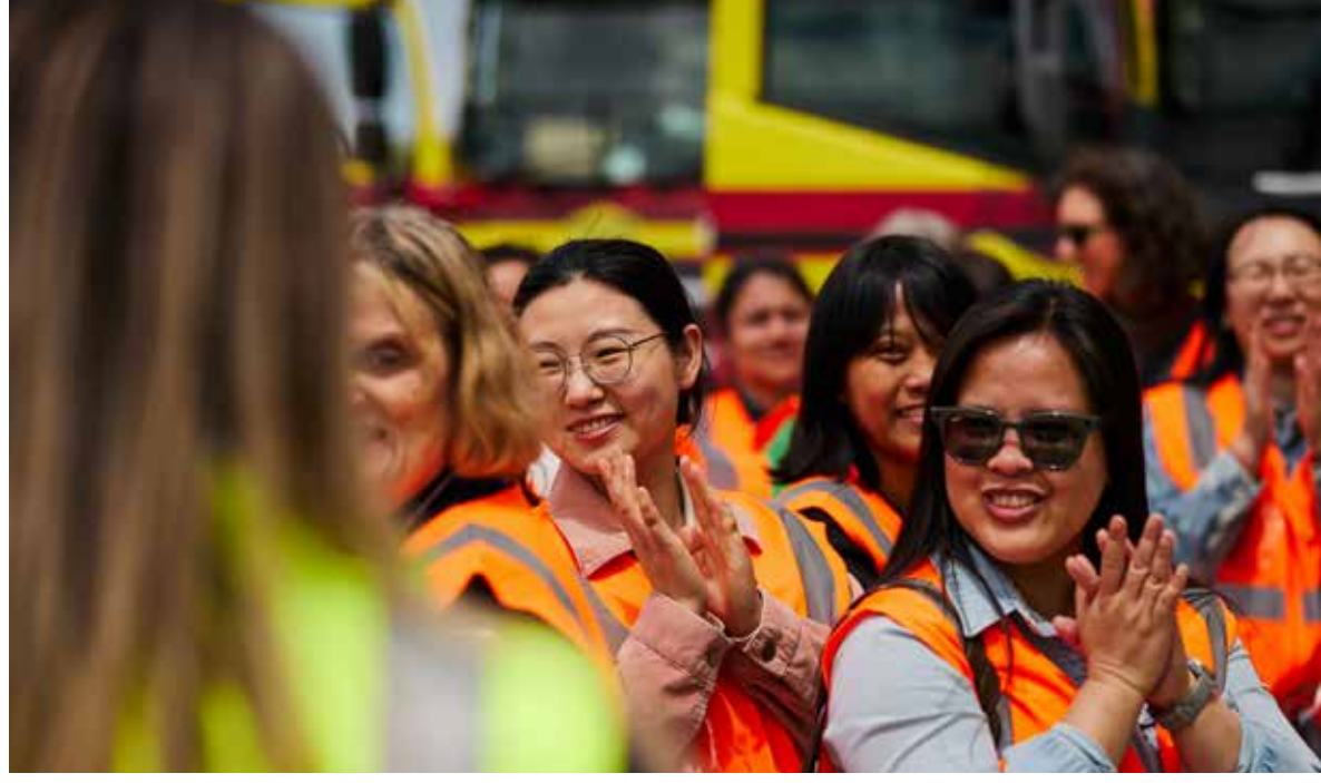
Wayfinder Attendees (Melbourne)