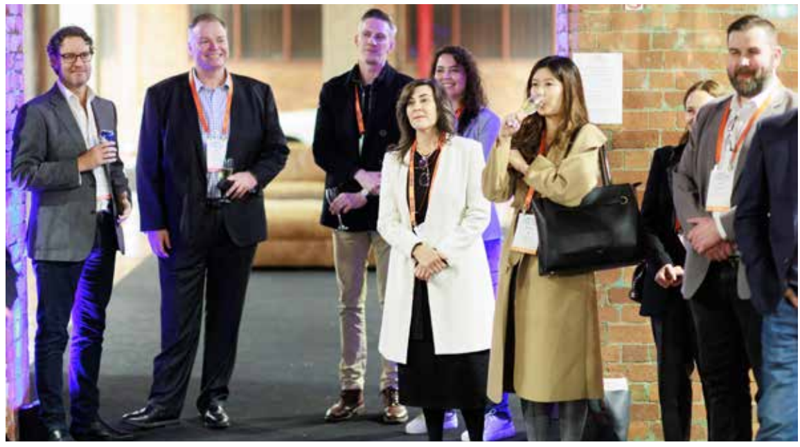
ALC Supply Chain Logistics Summit 2024