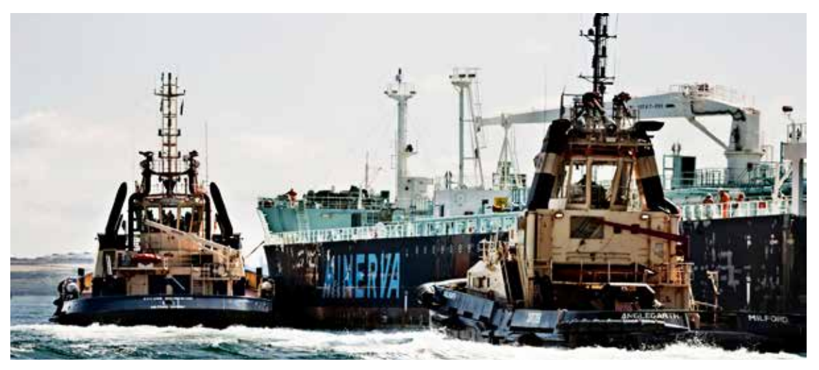
Tugs – Svitzer