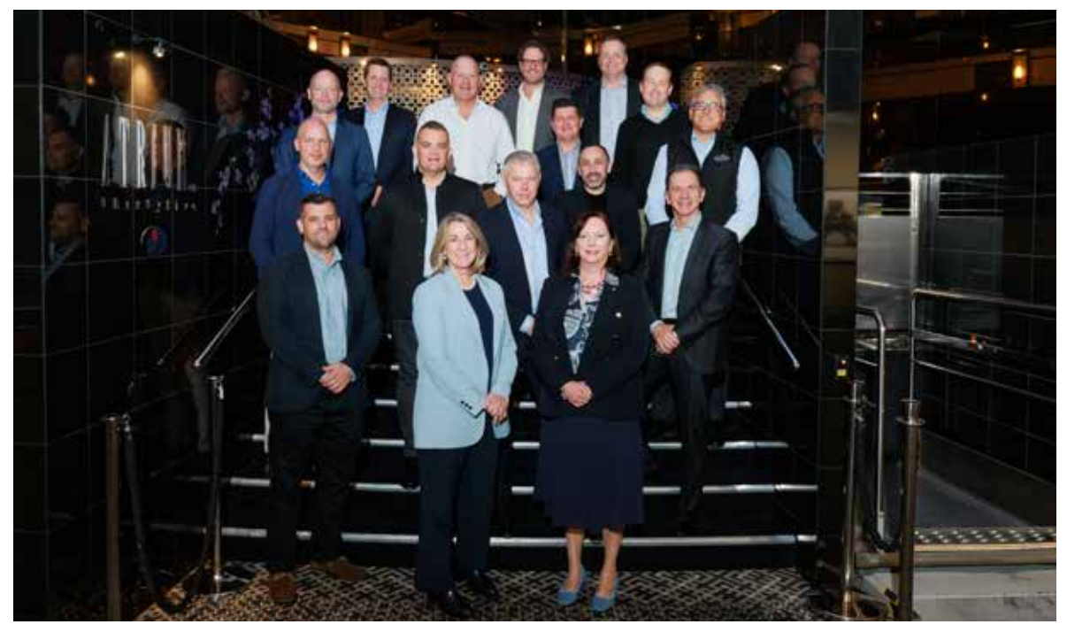
ALC Councillors at ALC Supply Chain Logistics Summit 2024