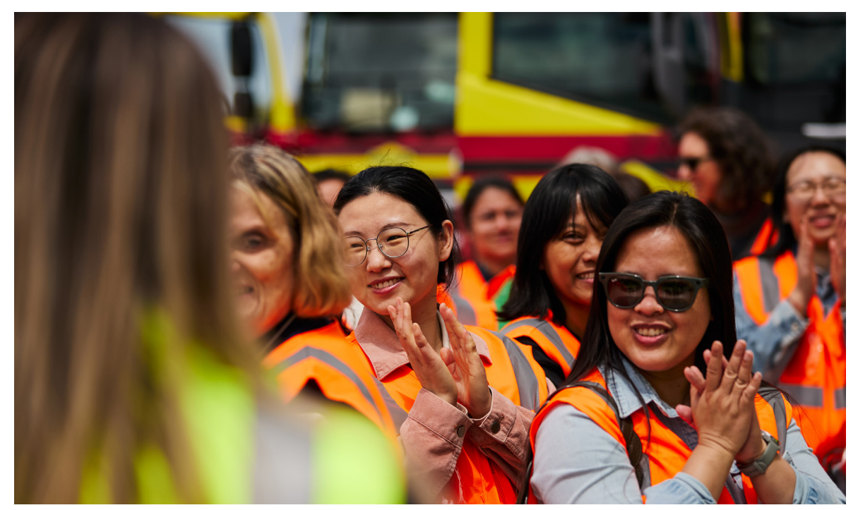
Wayfinder Attendees (Melbourne)