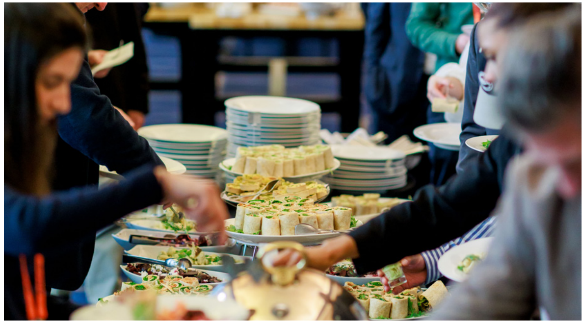
ALC Supply Chain Logistics Summit 2024