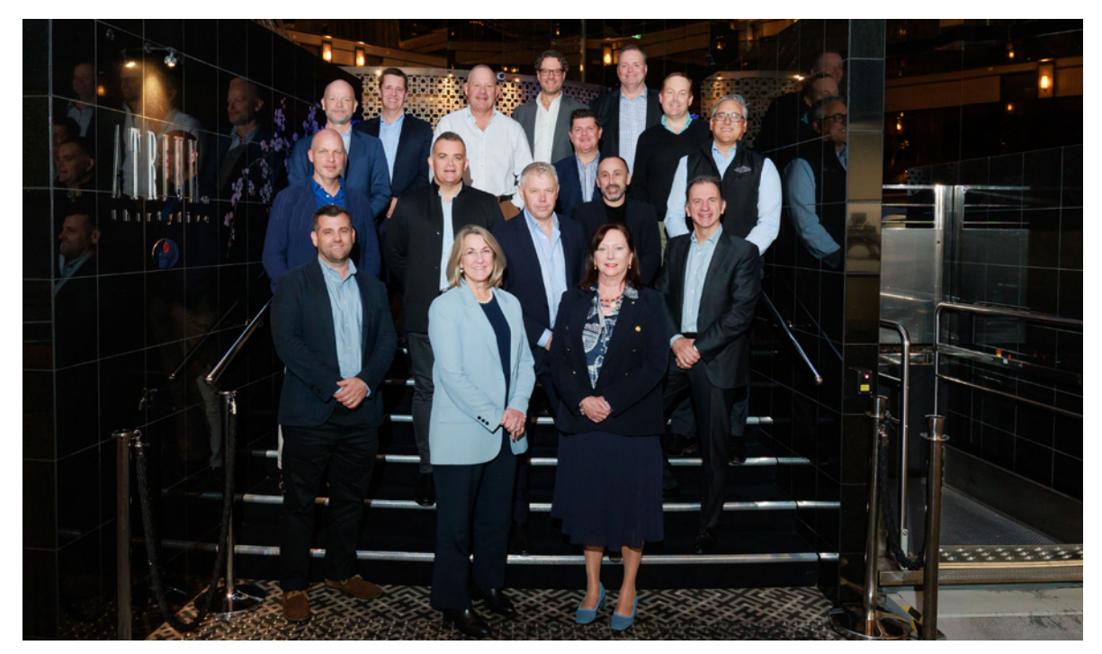
ALC Councillors at ALC Supply Chain Logistics Summit 2024