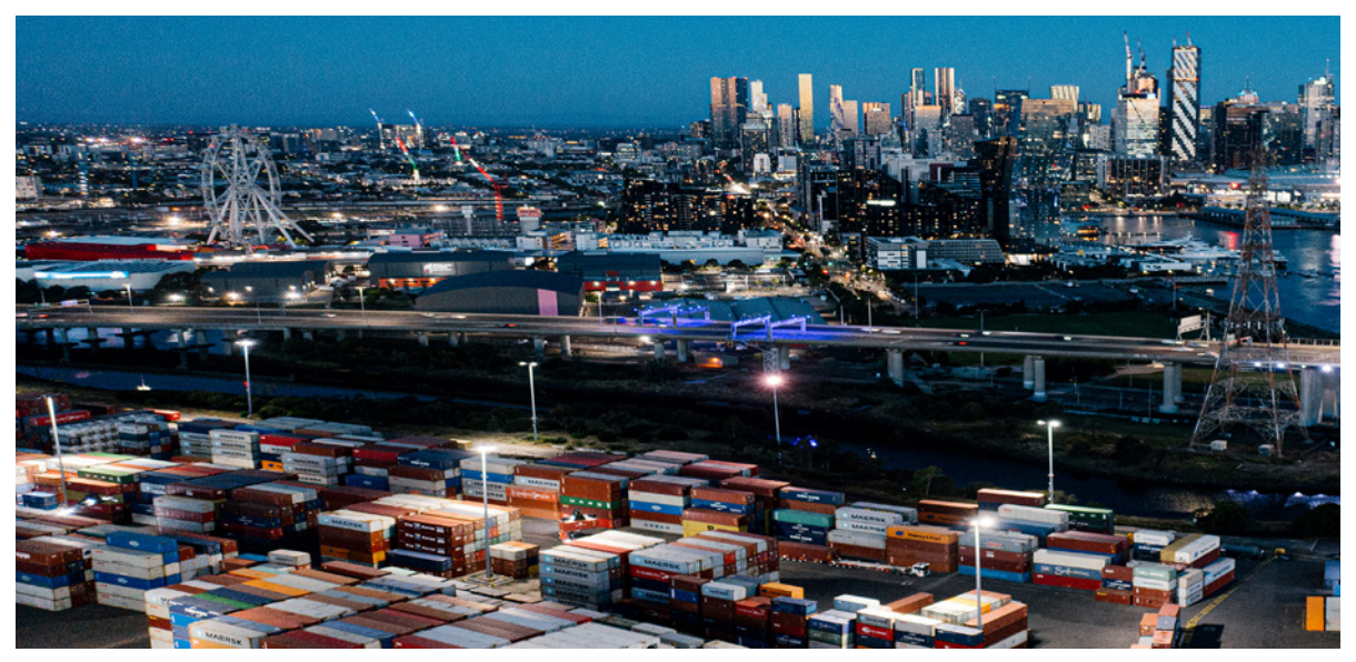
Port of Melbourne