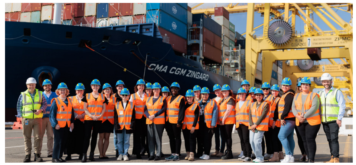
DP world, ALC Staff with Wayfinder Attendees (Sydney)