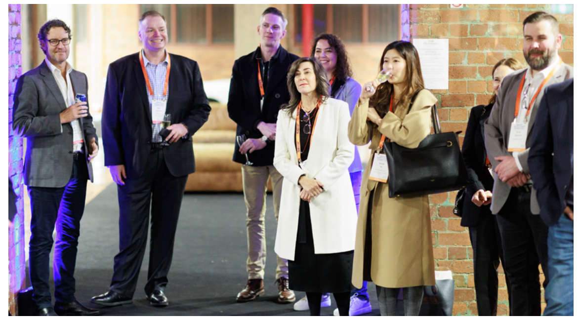
ALC Supply Chain Logistics Summit 2024