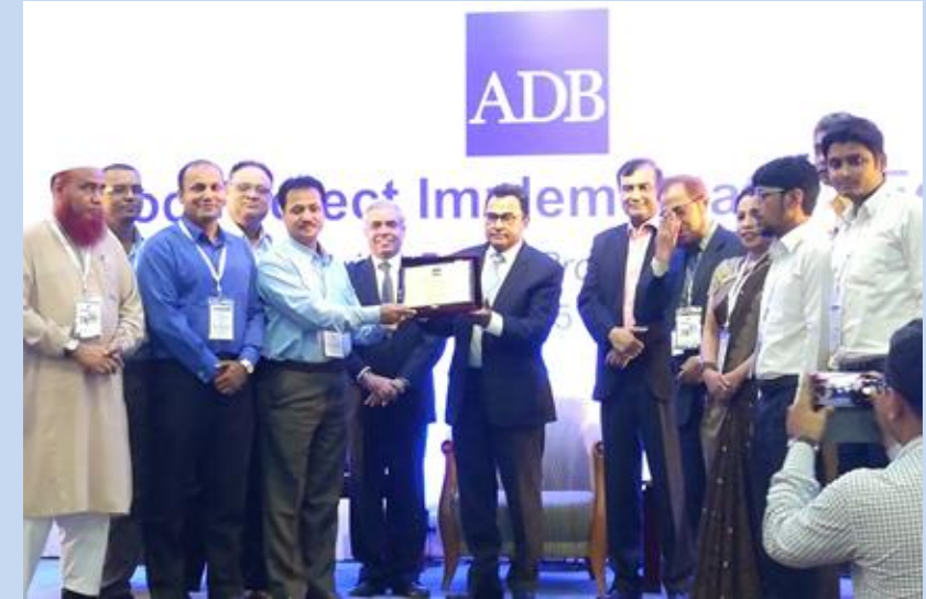
Champion for Exemplary Gender Mainstreaming & Runner-up in Social Safeguards: Award Crests Handed Over by Hon'ble Finance Minister in Presence of ADB Country Director