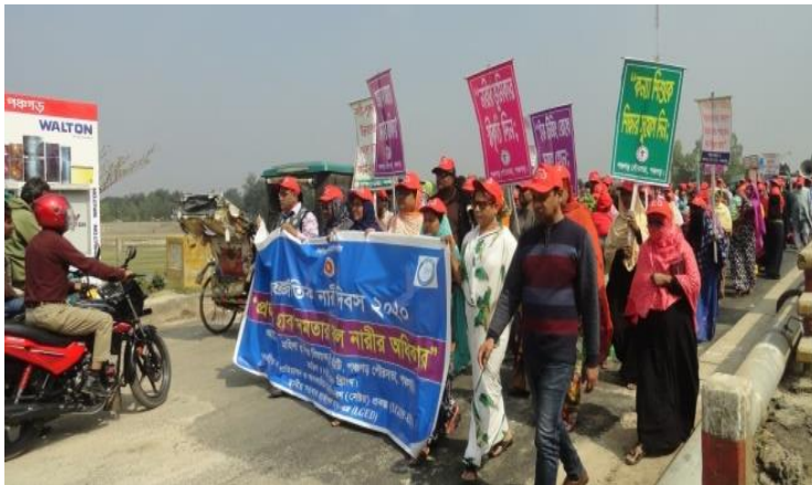
Celebration of International Women Day 2020 by Panchagarh Pourashava