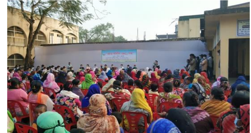
Courtyard Meeting at Khagrachari Pourashava