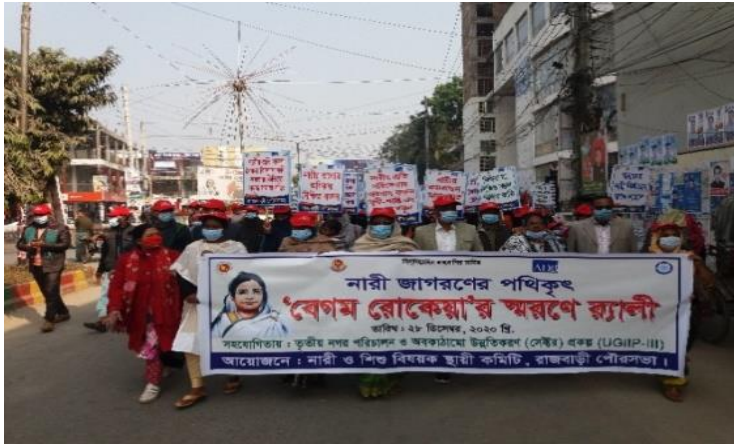
Celebration of Begum Rokeya Day at Rajbari Pourashava