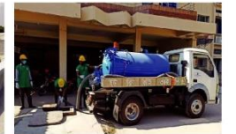
পয়ঃবর্জ্য অপসারণ কার্যক্রম