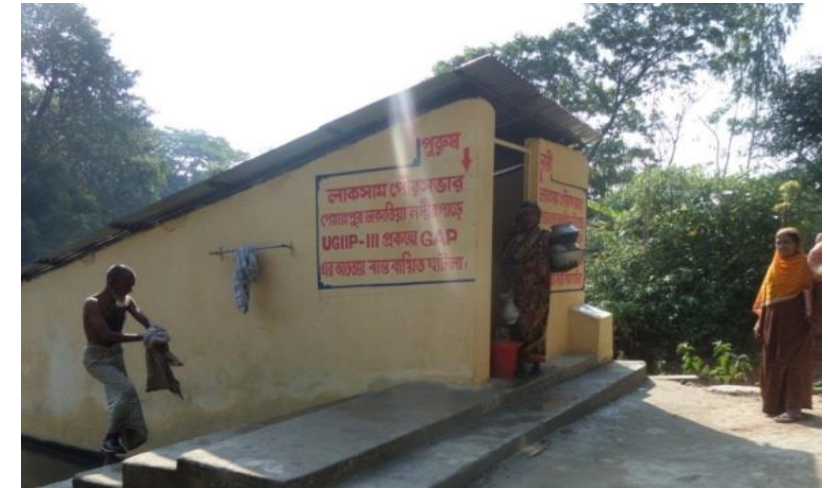
Bathing place for women at the pond side (Ghatla) constructed by Laksam Pourashava with GAP budget