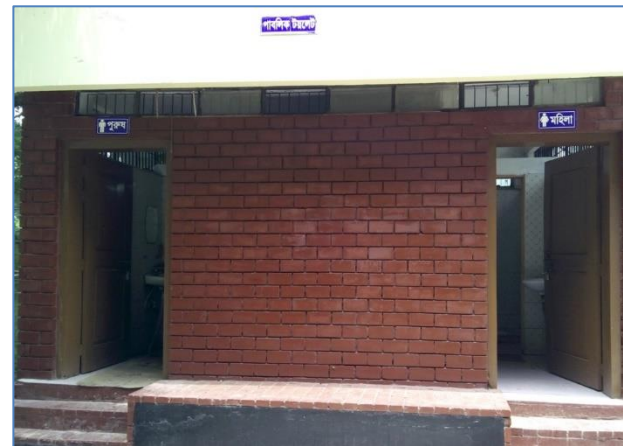
Public Toilet with Separate Entry for Women