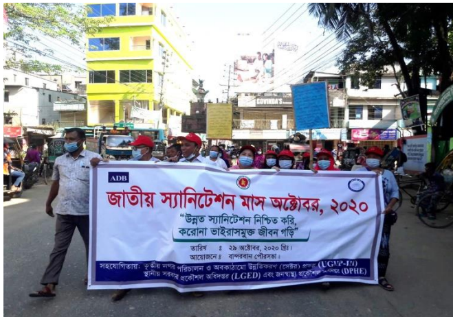
Participation of women in the rally of National Sanitation Month October-2020, Bandarbon Pourashava