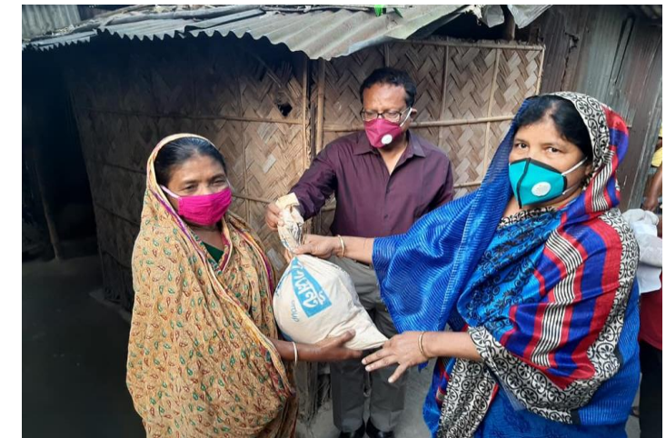
Councilor of Sherpur Pourashava providing food support to poor woman as part of GAP implementation