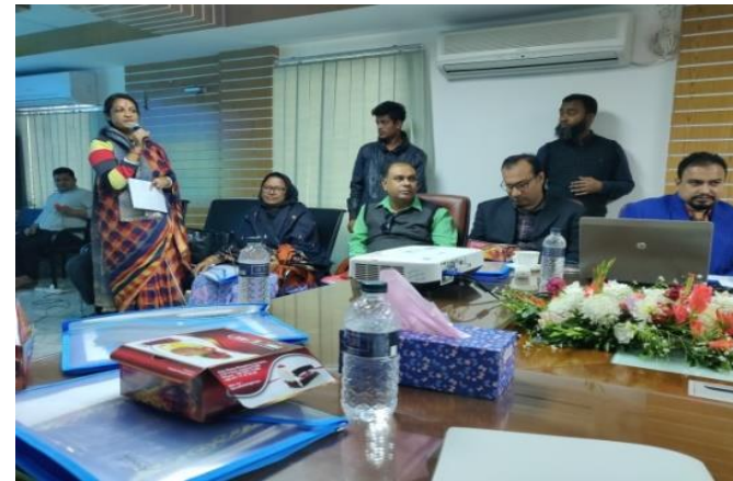
Woman active in TLCC meeting at Jessore Pourashava