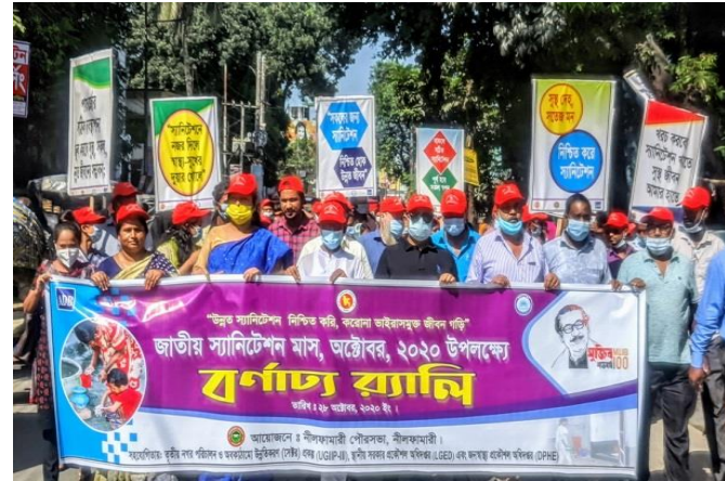
Celebration of Sanitation Month October 2020 at Nilphamari Pourashava