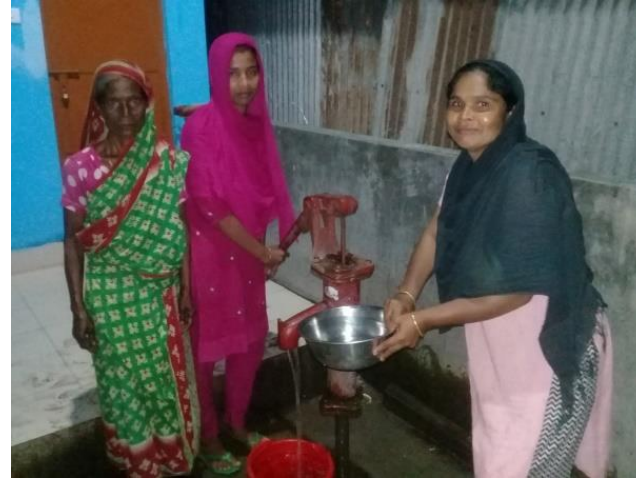
Tube-well at the door step reduced time of women in slums of Lalmonirhat Pourashava Pourashava