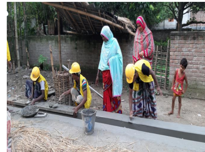
Female SIC leaders supervising Drain Construction Work at Slum in Chapai Nawabganj Pourashava