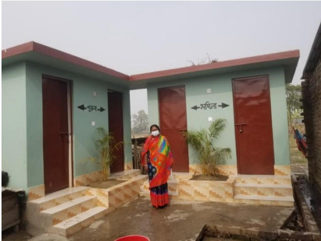
Community Latrine at the Sweeper Colony with separate male and female chambers, Joypurhat Pourashava