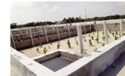
নির্মাণস্থল পরামর্শ পরিবেশনা

বর্জ্য ব্যবস্থাপনা, ল্যান্ডফিল, পয়ঃবর্জ্য পরিশোধনাগার নির্মাণ, পরিচালন ও রক্ষণাবেক্ষণ নির্দেশিকা (খসড়া)