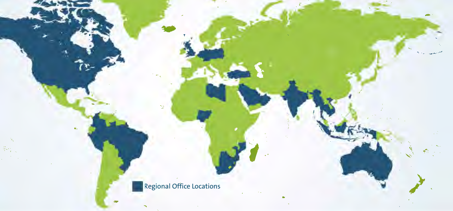
Regional Office Locations

As a collective of engineers, consultants and project managers, Royal HaskoningDHV has a deeply rooted understanding of the physical and social environment. In our everyday work we digitally transform this ingrained knowledge to create efficient designs that both minimise negative environmental impacts and maximise positive social impacts and society's resilience to climate change. We recognise that the challenges the world faces, as captured in the UN Sustainable Development Goals, need to be addressed urgently, and can only be tackled by enacting systemic change in the way we conduct business.