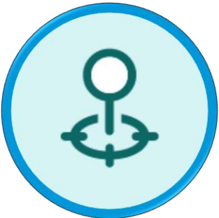
Metrology Knowledge & Optimum Sensor Positioning