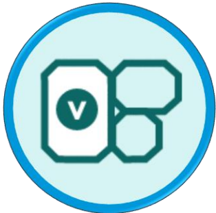
Virtual DMAs (sectors)