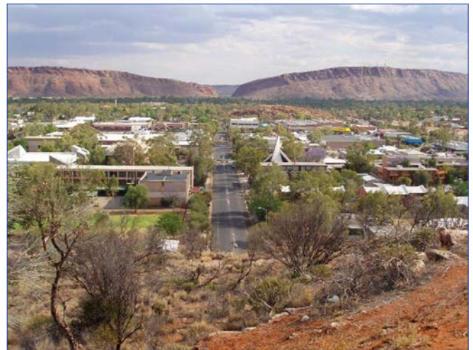
Figure 1: Aerial photo of Alice Springs

While the township of Alice Springs is not, most land in the Alice Springs region (and the Northern Territory in general) is tenured by the traditional landowners, concurrent with underlying native title status (Austrade, 2019) (Figure 3).