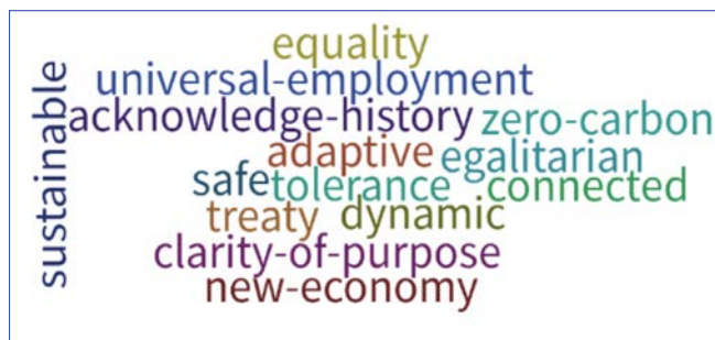
Word cloud 3: Vision for Alice Springs for 2030–2050

The question ‘What is your vision for 2030 to 2050?’ elicited a variety of responses, including new economy , sustainable and dynamic . Participants noted that coordination across levels of government was difficult and often slowed the governance process. Yet the Australian nation has mobilised quickly on policy issues before, such as those concerning firearms, with rapid unification across states. This type of dynamic governance is needed to address the pressing issue of creating a sustainable future.