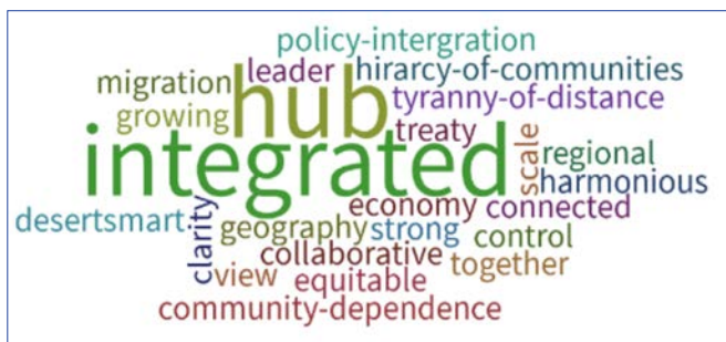
Word cloud 1: Vision for a sustainable future in Alice Springs

The most popular answers to the question ‘What is your vision for a sustainable future nationally?’ were leadership , treaty and diversity/diversified , with two entries each. Participants emphasised that local governance was needed at the appropriate scales, as national initiatives might not suit the particular needs of Alice Springs. Diversity referred to the varied population that already exists in Alice Springs, with a large Indigenous community, while also reflecting current and future immigration from Eurasia to the Alice Springs region.