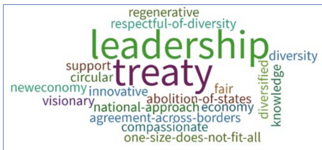
Word cloud 2: Vision for a sustainable future nationally

Treaty refers to a desire for a formal agreement between the Australian government and Indigenous people that would have legal outcomes. This treaty could recognise Indigenous peoples’ history and prior occupation of the land, as well as the injustices that many have endured