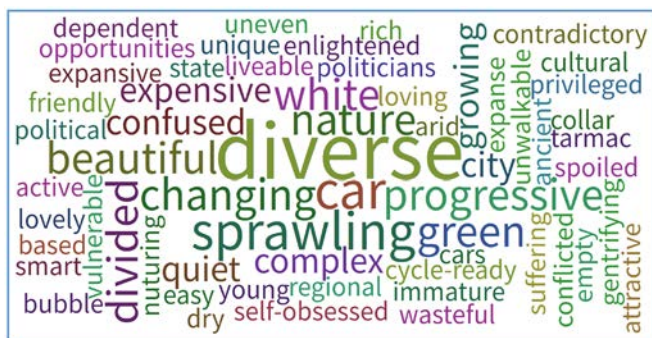
Word cloud 1: Current perceptions of Canberra

Although seven people entered diverse , this meant different things to different people. Some meant diversity of place—the range of environments from the mountains to the coast. Others meant diversity of people—referring to the immigration of people from different places for different reasons.