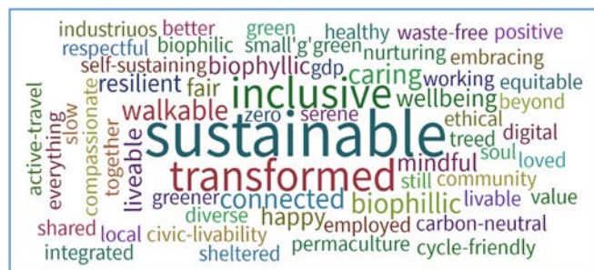
Word cloud 2: Vision for Canberra for 2030–2050

The most popular answer to the question 'What would you like the ACT region to be like in 30 to 50 years?' was sustainable , with 12 entries, and inclusive , with seven (word cloud 2).