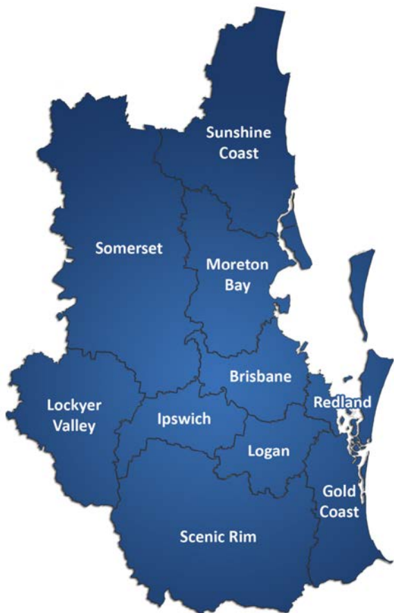
Figure 1: South East Queensland LGAs

SEQ is Australia's third largest urban region by population and home to around 3.5 million people, which is one in seven Australians and 71% of Queensland's population (Queensland Government, 2016b). The population is predicted to grow to 4.9 million by 2036. SEQ covers 22 900 km 2 and contains 12 LGAs (Figure 1).