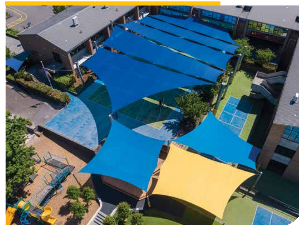
Commercial NinetyFive® in action - Melbourne Private School.

"Based on past performance and our long-standing history with the Commercial NinetyFive® fabric, it was an easy decision to use it again for the 'next generation' of superb shade coverage."