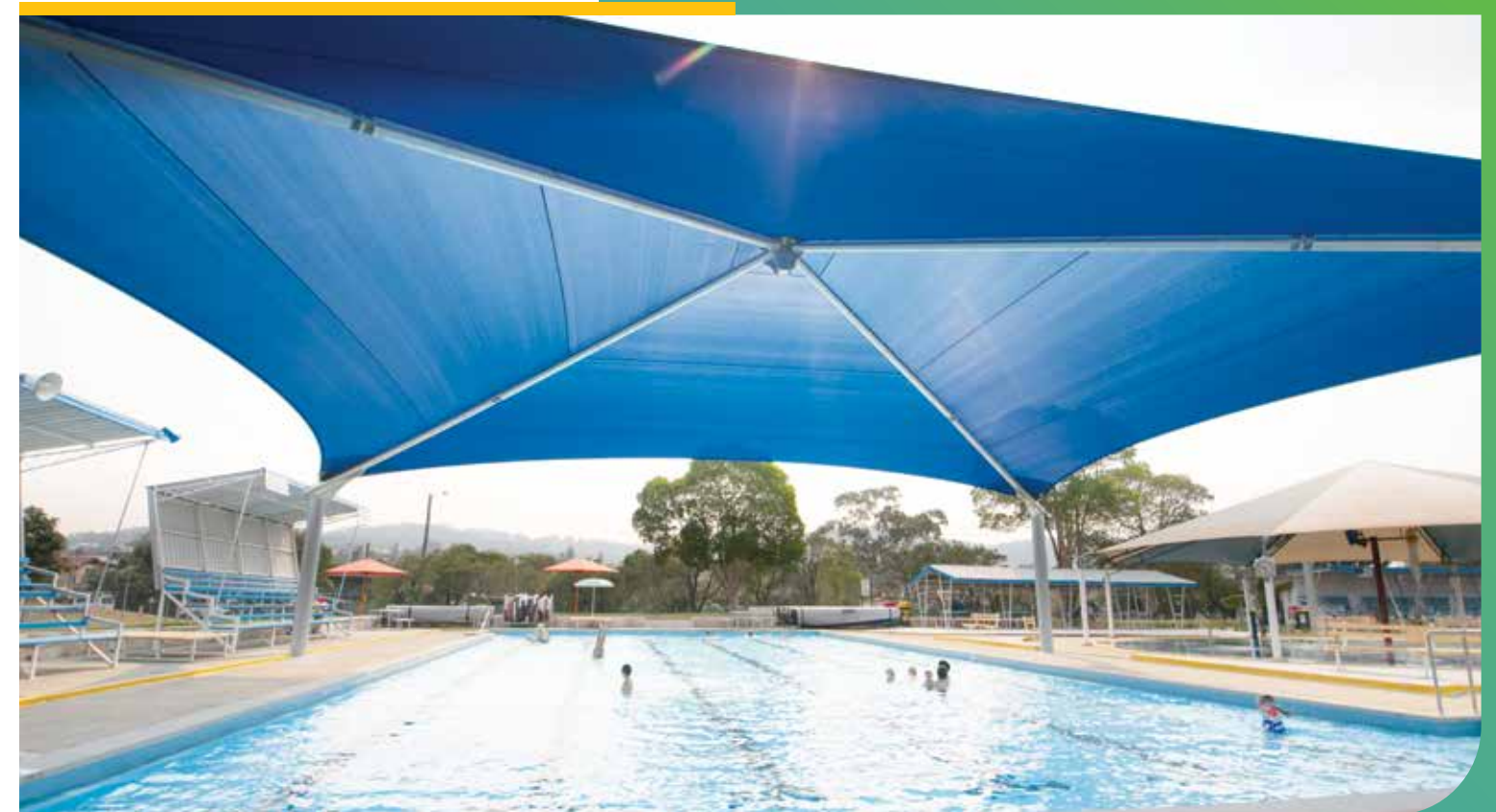
Speers Point Swim Centre, NSW

Sail Fabrication: West Coast Shade. www.westcoastshade.com.au