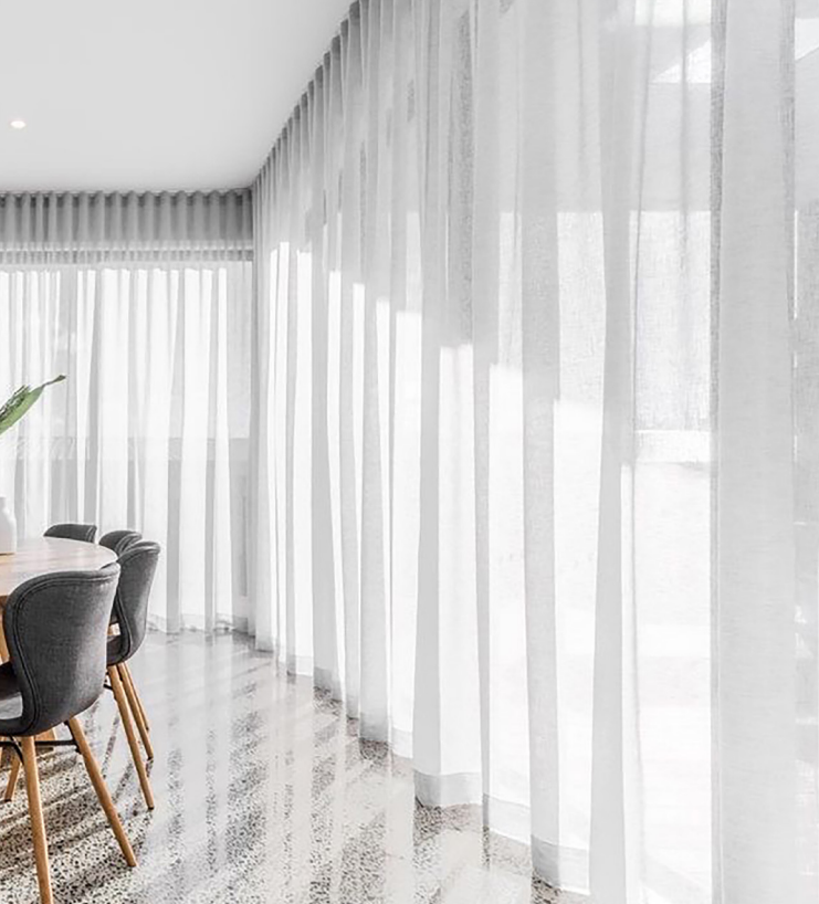
Cannes Pearl by R&D Curtains