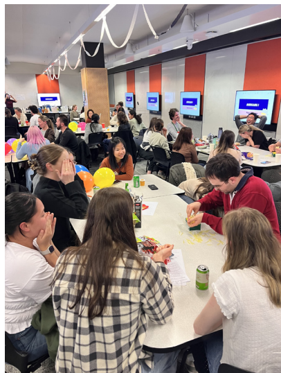
Close competition in the tip box packing table game at the 2025 APG Quiz Night.

this collaboration with the PPG, to further increase our reach and offer unique opportunities for our students and ECRs to network outside of SA.