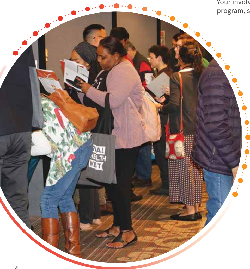
Delegates visiting the trade exhibition booths at the Aboriginal Health Conference 2019.

Your involvement will be featured in the final program, subject to printing deadline.