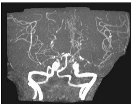
Image 2 (above): MRA brain showing multiples areas of constriction within multiple vessels particularly affecting the anterior circulation, middle cerebral arteries and supraclinoid ICAs